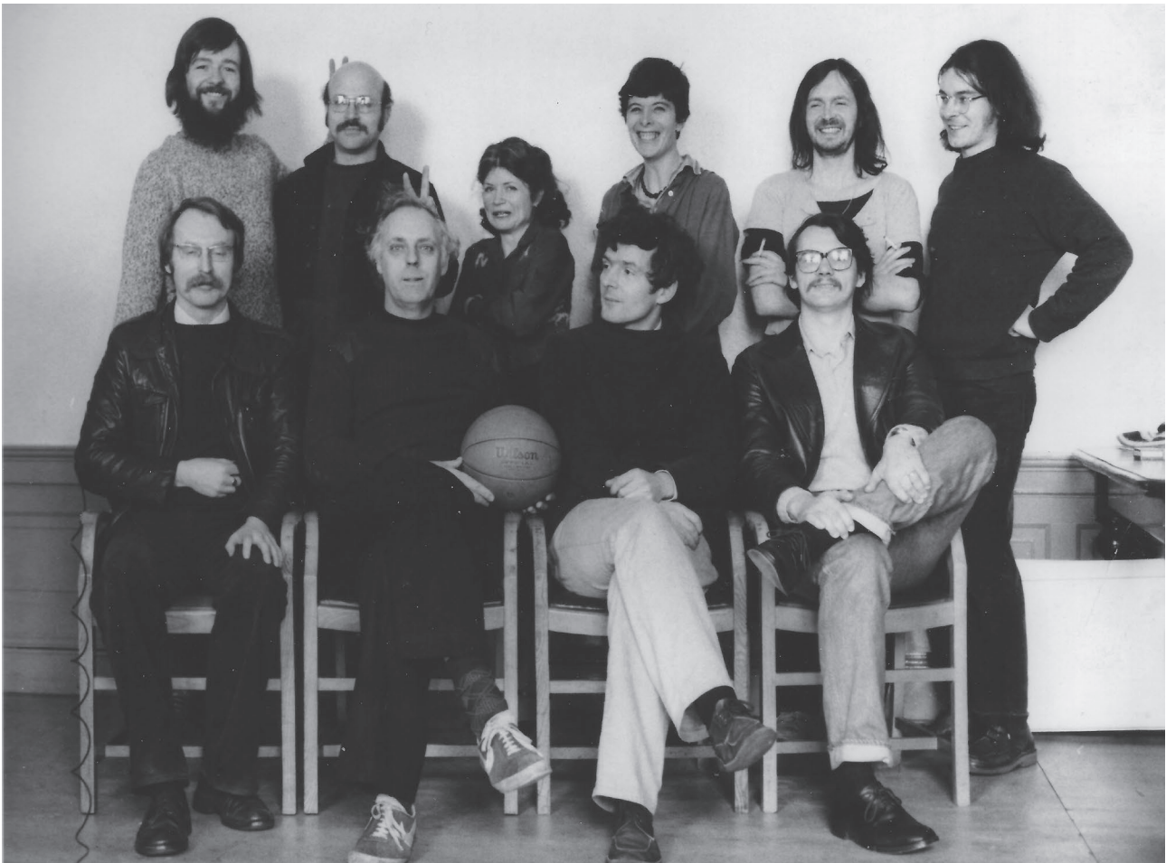
Fig. 2: Members of the Science Studies Unit in the early 1980s